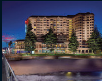
STAMFORD GRAND ADELAIDE

150 North Terrace Adelaide, SA 5000 Australia Telephone +61 8 8461 1111 sales@spa.stamford.com.au www.stamford.com.au/spa