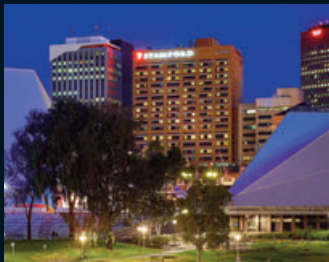
STAMFORD PLAZA ADELAIDE

Cnr Edward & Margaret Streets Brisbane, QLD 4000 Australia Telephone +61 7 3221 1999 sales@spb.stamford.com.au www.stamford.com.au/spb