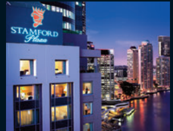
STAMFORD PLAZA BRISBANE

111 Little Collins Street Melbourne, VIC 3000 Australia Telephone +61 3 9659 1000 sales@spm.stamford.com.au www.stamford.com.au/spm