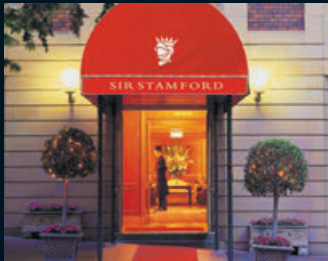
SIR STAMFORD AT CIRCULAR QUAY

With seven landmark venues, from boutique charm to contemporary style, we have the perfect meeting or conference facility for you.