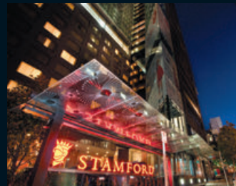
STAMFORD PLAZA AUCKLAND

Moseley Square Glenelg, SA 5045 Australia Telephone +61 8 8376 1222 sales@sga.stamford.com.au www.stamford.com.au/sga