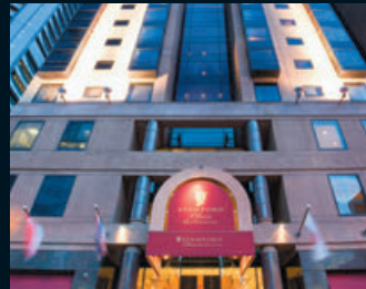
STAMFORD PLAZA MELBOURNE

Cnr Robey & O'Riordan Streets Mascot, NSW 2020 Australia Telephone +61 2 9317 2200 sales@spsa.stamford.com.au www.stamford.com.au/ssa