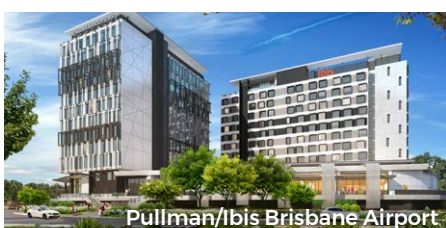
Pullman/Ibis Brisbane Airport

Situated in the trendy shopping precinct of James Street, Fortitude Valley, the boutique 4.5-star Sage Hotel comprises 93 rooms over four levels as well as onsite dining options and a dedicated functions space. Built around the iconic Queens Arms, the hotel seamlessly combines the traditional façade with modern interiors.