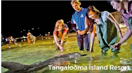
Tangalooma Island Resort