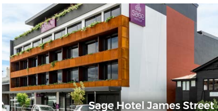
Sage Hotel James Street